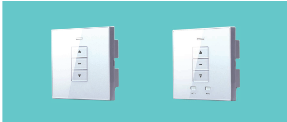
LK-MR531 LK-MR533 LK-MR535 LK-MR536